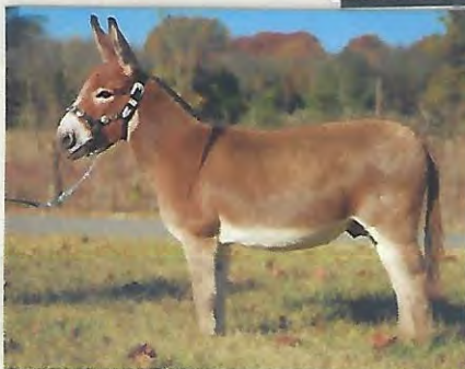
Cedar Oaks Rojo 2.jpg